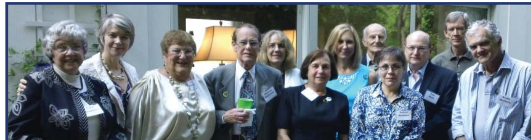
NAMI Mercer Patron Society 2013