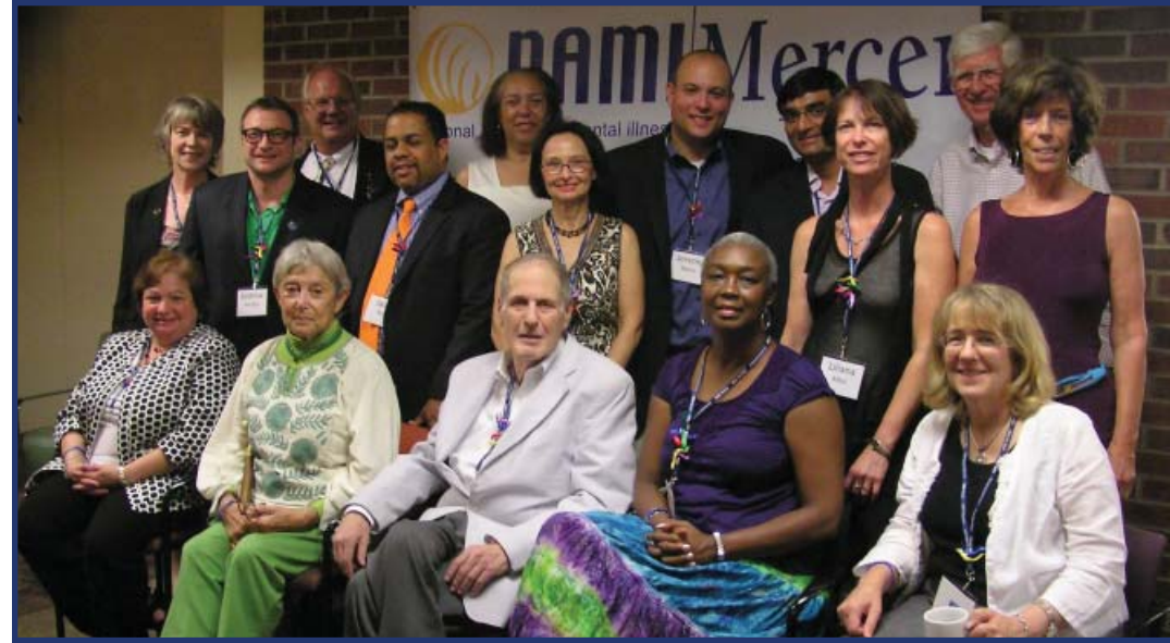
NAMI Mercer Board 2013

ESTABLISHED IN 1984, NAMI MERCER ENVISIONS AND WORKS TOWARD A FUTURE WHEN FAMILIES AND INDIVIDUALS WITH MENTAL ILLNESS WILL REALIZE THEIR FULL POTENTIAL IN A RESPECTFUL AND UNDERSTANDING SOCIETY.