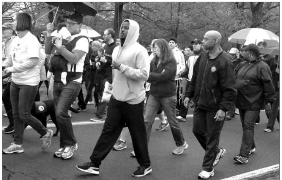
Walkers step out in light rain at NAMIWalks Mercer County, May 7. Photos on Page 5.